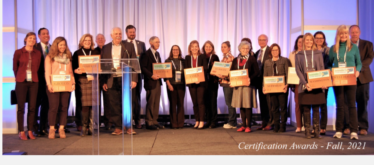
Certification Awards - Fall, 2021

Find Our Workshops & Coffee Hours on the Sustainable CT YouTube Channel