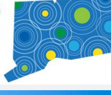
Fox Hill Tower, Vernon